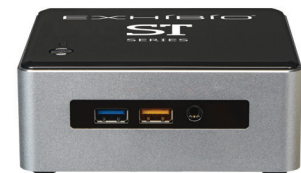
Remote Smart Terminal